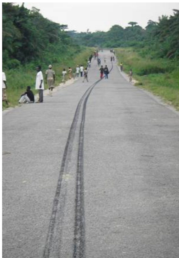
Photograph 1: Section of the road used as an airstrip in Mobi, Walikale

111. The Goma airport, with an average of nearly 40 movements per day, has become the leading airport in the eastern part of the Democratic Republic of the Congo from the standpoint of air traffic. Registered traffic at Goma includes nearly 40 aircraft of all types (Twin Otter DHC-6, Cessna Caravan, AN-12, LET410, AN-24, AN-32, DHC-8, CASA 212, Partenavia 68 CTC).